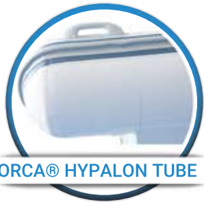
ORCA® HYPALON TUBE

The tubes are made with 5-ply Chloro-sulfonated Polyethylene (CSM) ORCA® HYPALON 828 manufactured by Pennel & Flipo™. This fabric is used by professional and military grade boats and is so superior we guarantee it with a ten (10) year warranty.