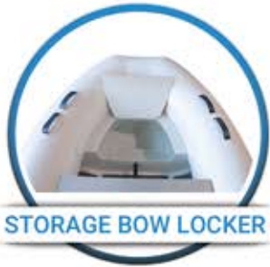
STORAGE BOW LOCKER

The tubes are made with 5-ply Chlorosulfonated Polyethylene (CSM) ORCA® HYPALON 828 manufactured by Pennel & Flipo™. This fabric is used by professional and military grade boats and is so superior we guarantee it with a ten (10) year warranty.