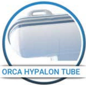
ORCA HYPALON TUBE

The tubes are made with 5-ply Chlorosulfonated Polyethylene (CSM) ORCA® HYPALON 828 manufactured by Pennel & Flipo™. This fabric is used by professional and military grade boats and is so superior we guarantee it with a ten (10) year warranty.